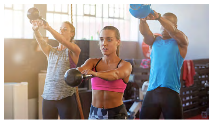
HMSA Active & Fit Program https://hmsa.com/well-being/active-and-fit/

If adding to an insurance rider it would require the business (kumu hula) to have a Tax ID, agreement to use the online platform to manage participation and usually receive a slightly lower reimbursement than private pay. Other restrictions may apply. If hula were added to HMSA 365, the kumu hula would require recognition by the Better Business Bureau of Hawaii or a copy of their business certificate.