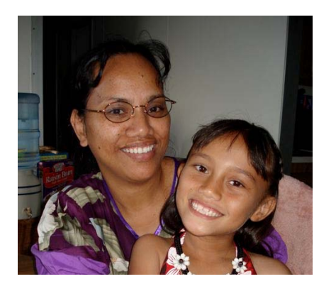
happiness, and authenticity.

We are called Native Hawaiians and Pacific Islanders . Modern day voyaging has taken hold of many of our family members and dispersed us to lands beyond our homelands to the Americas, Europe, and Asia, but we remain the indigenous peoples from the islands and seas that surround them within the great ocean, Moananuiloa .